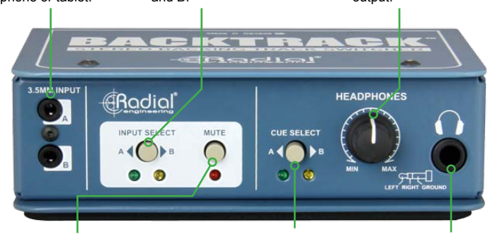
MUTE - Cuts signal to the Main and Monitor outputs.

HEADPHONE LEVEL - Sets the volume of the headphone output.