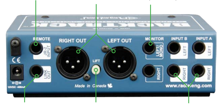
LINK OUT - ¼" TRS output to feed the remote input on a second Backtrack to operate both simultaneously.

MONITOR OUT - ¼" outputs for connection to a pair of powered speakers.