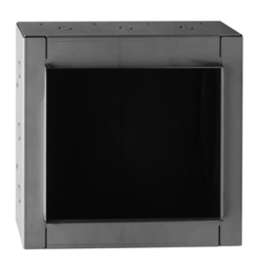
T20 8 ohms / 100 volt transformer, 20 watts