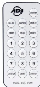
UC IR Wireless Remote Included