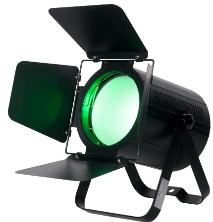
BAR001 - COB Cannon Wash Barn Doors sold separately