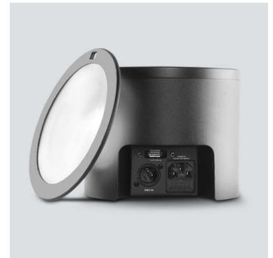
Robust and Sit-flat housing and Magnetic Fresnel lens allows you to go from ultra-wide to narrow beam