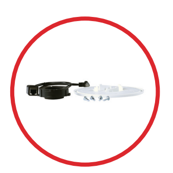
TCM-X-DK Plenum attachment for drywall ceilings

Biamp, Tesira, Parlé, Devio, and Beamtracking are either trademarks or registered trademarks of Biamp Systems, LLC in the United States and other countries. Other product names referenced may be trademarks or registered marks of their respective owners and Biamp Systems is not affiliated with or sponsored by these companies.