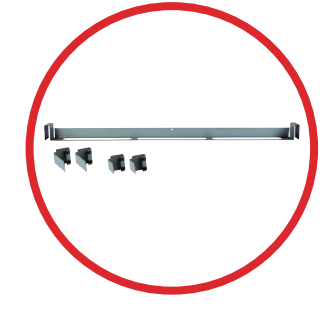
TB-1 Tile bridge for TCM plenum boxes