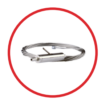
Seismic Cable Adapter Cable adapter for TCM plenum boxes