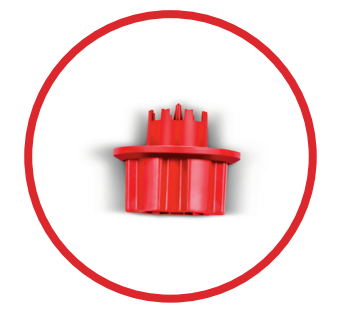
TCM-X Installation Tool Hole saw and driver