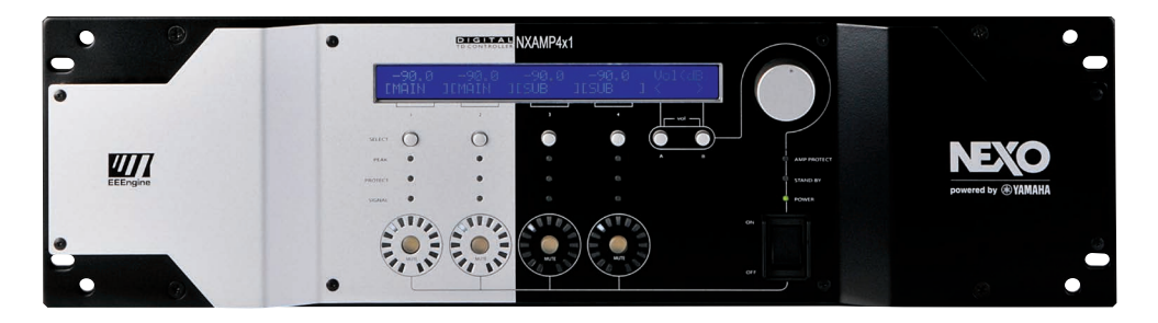
NXAMP 4x1 Powered TDController

Larger networks of NXAMPs can be monitored using the NEXO's NeMo Remote Monitoring App, available free for iPad® and iPhone®.