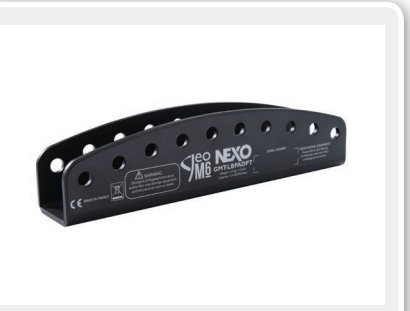
GMT-LBPADPT Angle setting plate for 3-cabinet clusters (hanging or pole mounted)