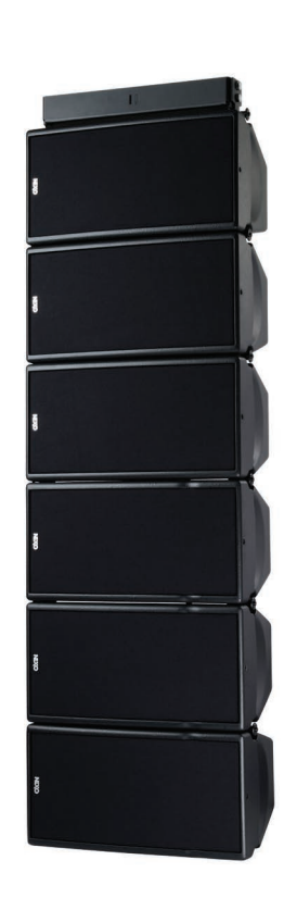
GEO M620 main and M6B bass extension cabinets can be flown in the same array to create a compact, powerful and discreet system, ideal for installation in small theatres and conference halls.