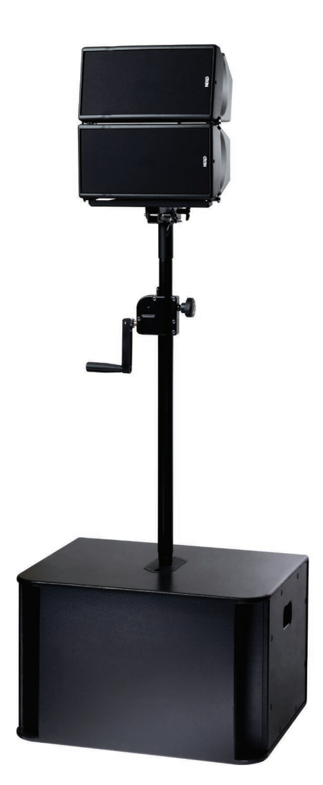
Pole-mounting a pair of GEO M620 Main cabinets on a NEXO LS600 subbass cabinet quickly creates a high-output, full range system.