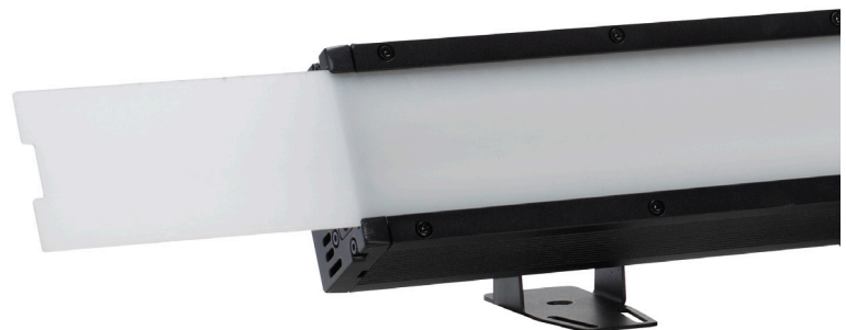
Removable frost filter