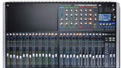
Si Performer 3