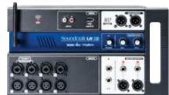
Ui12 12 inputs 4 aux/monitor sends