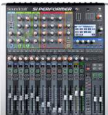
Si Performer 1

The 2 option card slots combine for a total of 128x96 possible cross-points that can provide a multitude of networking I/O options via the ViSi connect option card range or direct connection to any Soundcraft MADI stageboxes; positioning the Si Performer at the heart of any installation or music venue.