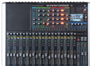
Si Performer 2