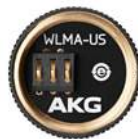
WLMA Shure® adaptor