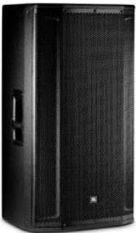
JBL SRX835 / SRX835P 15" 3-way