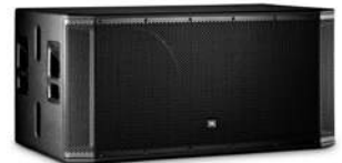
JBL SRX828S / SRX828SP Twin 18" subwoofer