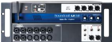
Ui16 16 inputs 6 aux/monitor sends

The system can double as a stagebox and can be controlled by up to 10 devices via Ethernet or built-in dual-band Wi-Fi, making it possible to control mixing and multi-track recording wirelessly from anywhere in the venue. Renowned Lexicon, dbx and DigiTech signal processing ensures pristine sound, while 20 Studer-designed microphone preamps deliver more professional inputs than any other mixer in its class.