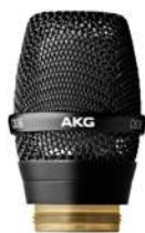
C636 Master Reference Condenser