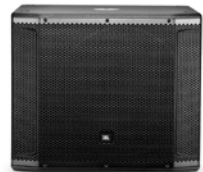
JBL SRX818S / SRX818SP 18" subwoofer