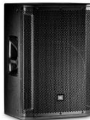
JBL SRX812 / SRX812P 12" 2-way