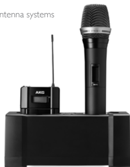
CU800 Charging Station