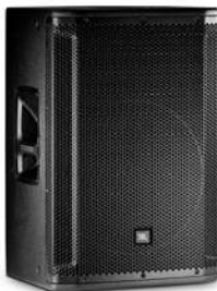
JBL SRX815 / SRX815P 15" 2-way